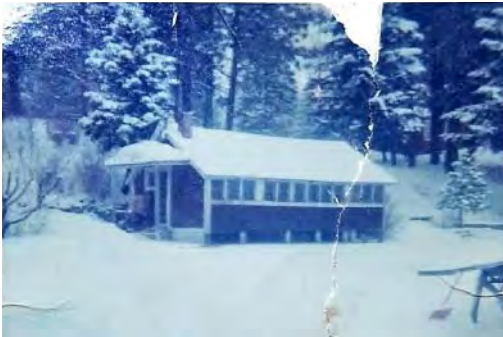
Hogan cabin was the boat house of Foote's Resort, Nov. 1967